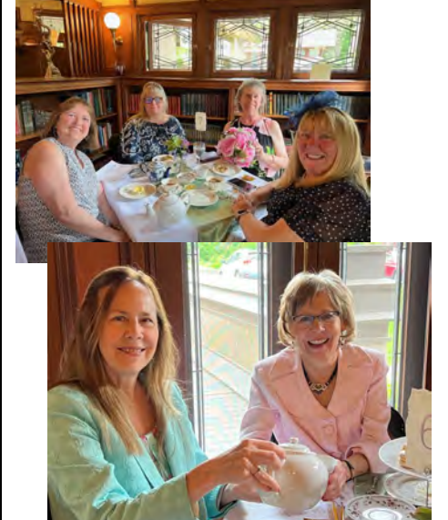
Did you miss the Tea Party?

Mark your calendar for Saturday, October 25, 2025. Tickets will be available soon!