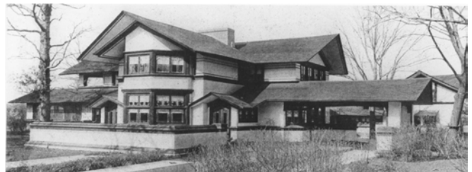
B. Harley Bradley House, 1900